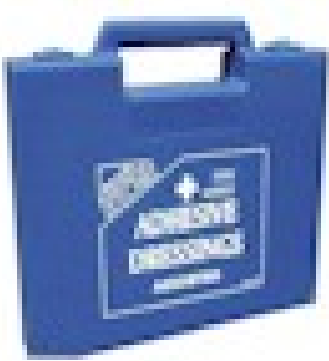
Catering Plaster Kit